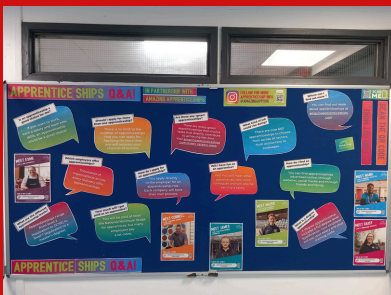
Q&A display in the Blue Dining Hall